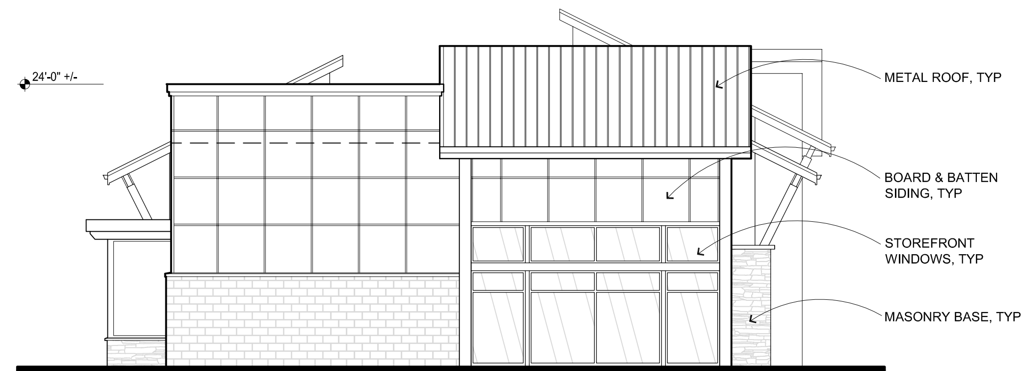
BUILDING 1 - CONCEPTUAL EAST ELEVATION