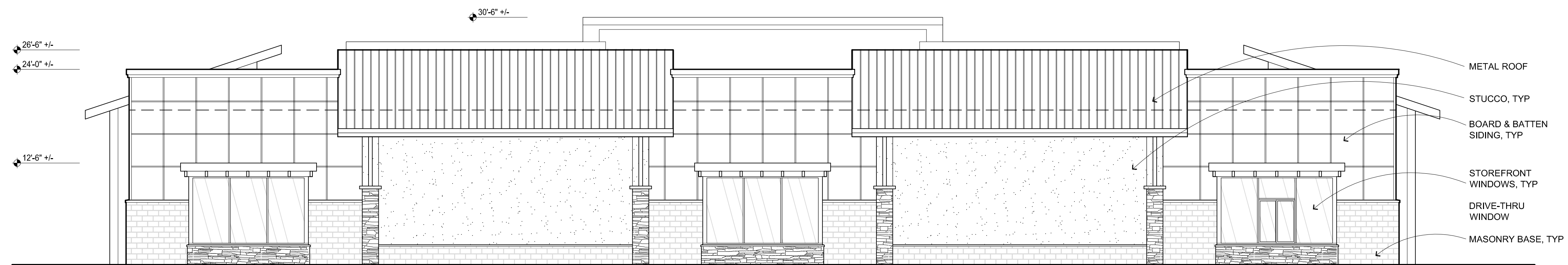
BUILDING 1 - CONCEPTUAL SOUTH ELEVATION